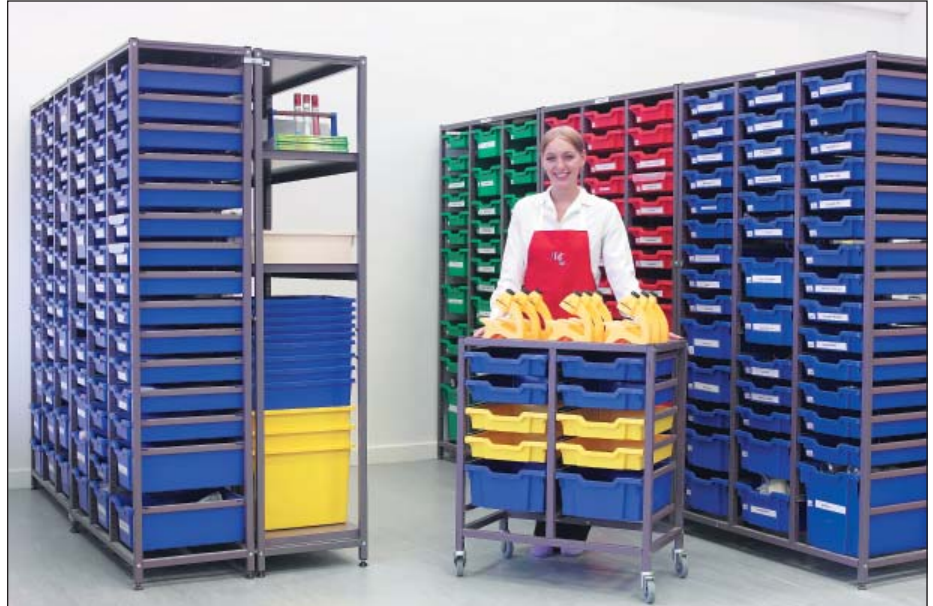
Chafford Hundred: Science preparation room fitted with Gratnells science storage system.

Chafford Hundred Campus Secondary School is a unique educational institution serving Chafford Hundred and the surrounding catchment area.