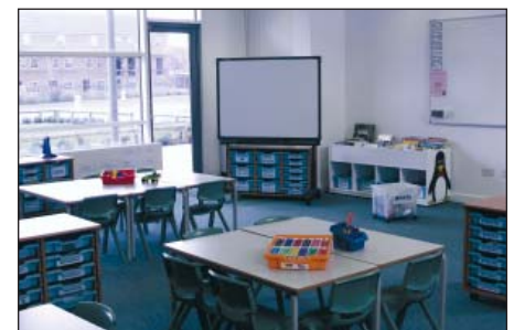
Classroom featuring Gratnells tray storage.

In addition, Gratnells provided the storage systems for the school's design and technology area, as well as the staff resource room.