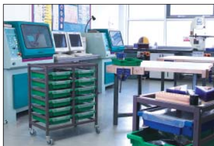
Design and technology room.

Gratnells supplied a full science storage system for the Campus science preparation room working to the school's demanding specification. The system included metal frames and accompanying shelves and trays, plus trolleys for transporting equipment and materials from the preparation room to the classroom.