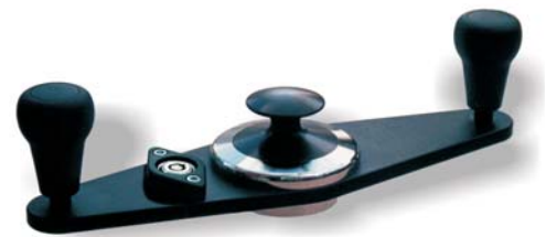
Each handwheel locks the drive mechanism and allows safe entry into the open aisle when depressed.

Ramps can be fitted to every access point, allowing access into the open system by trolley or wheelchair.