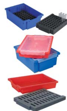
Fitted with Gratnells trays, inserts and lids.