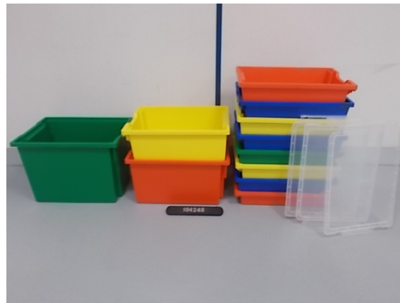
SGS authenticate photo on original report only