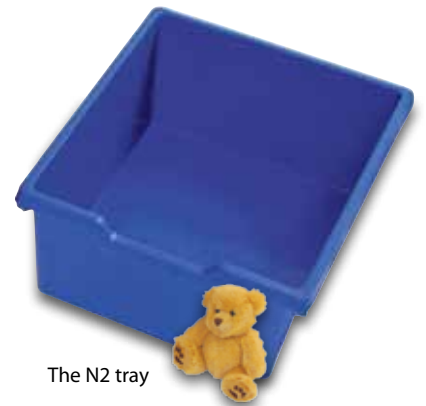
The N2 tray