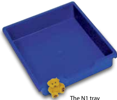
The N1 tray