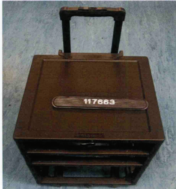
SGS authenticates the photo on original report only