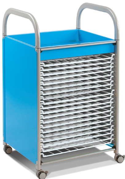
20 Drying Racks