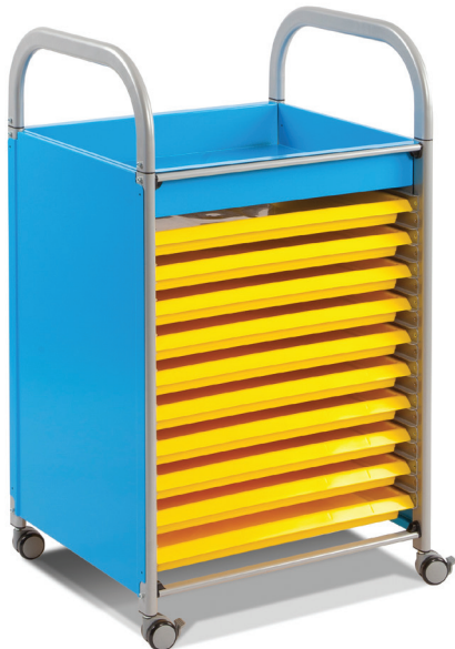
10 Art Trays