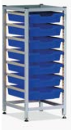
Bench Height Single Frame