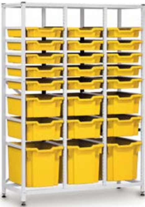
Mid Treble Frame