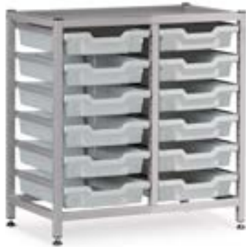
Under Bench Double Frame

These frames are complete with tops, adjustable feet, and back diagonal bars for additional rigidity meaning they are perfect for bulk storage. Brackets are also available to join frames or fix to walls.