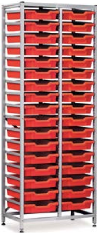
Tall Double Frame