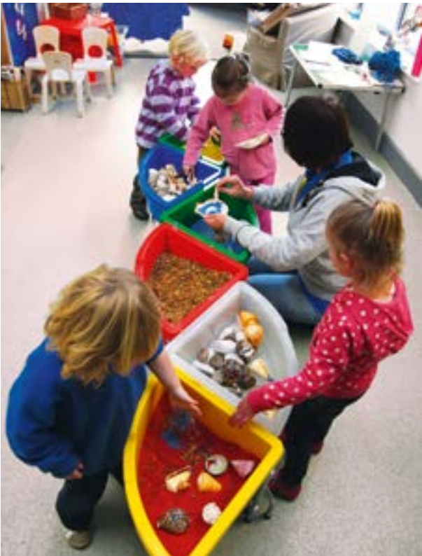
Exploration Table 4 Quadrant Trays